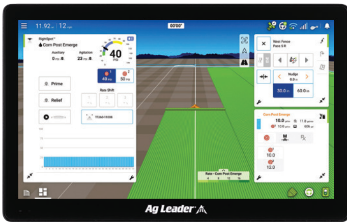
Controlled on the InCommand® Go 16